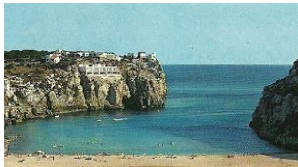
Cala en Porter Beach - 1965