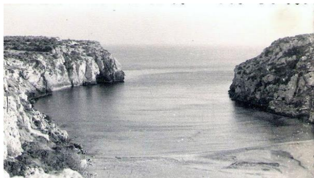
1955 – Cala en Porter Beach