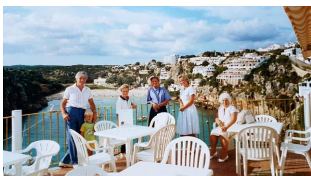
1990s – Club Menorca Restaurant Terrace