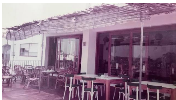
1980s - Club Menorca Restaurant Terrace