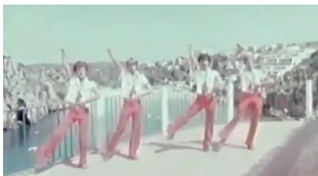
1970s - Raffaella Carrà Music Video