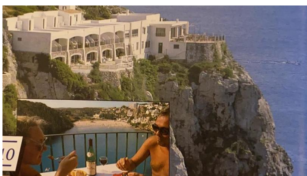
Club Menorca - 1988